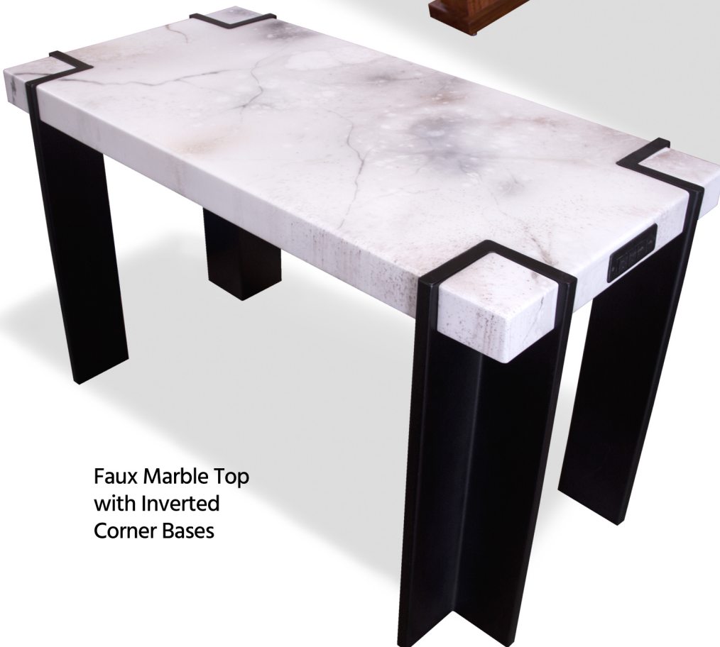
Faux Marble Top with Inverted Corner Bases