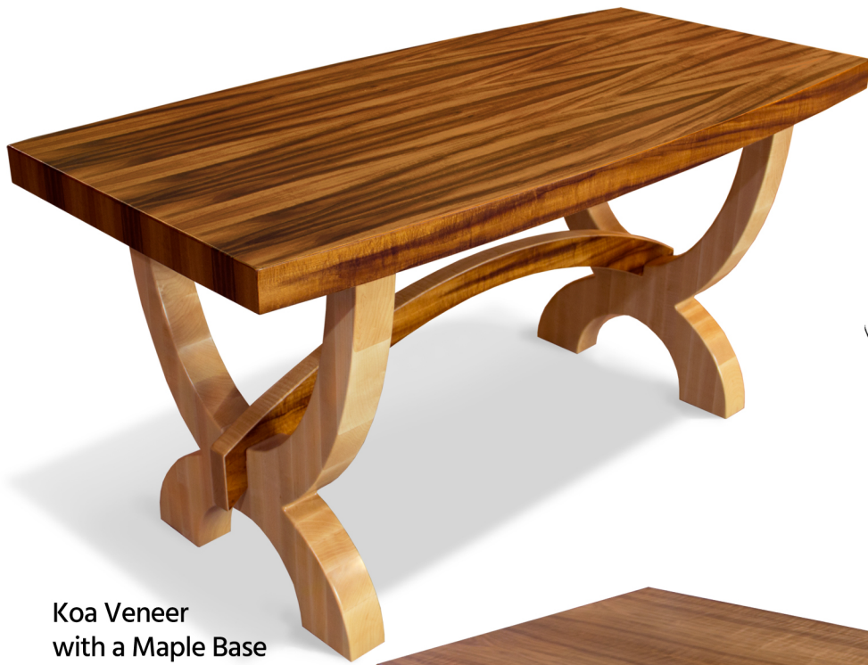
Koa Veneer with a Maple Base