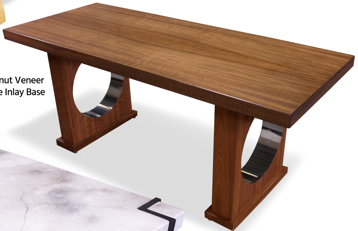
Figured Walnut Veneer with Chrome Inlay Base

Built to Stay Beautiful Built in the U.S.A