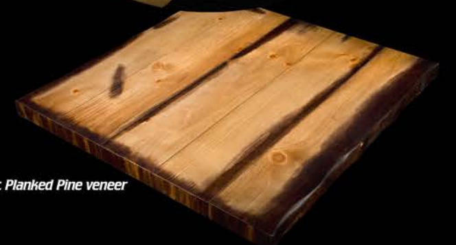
Rustic Planked Pine veneer