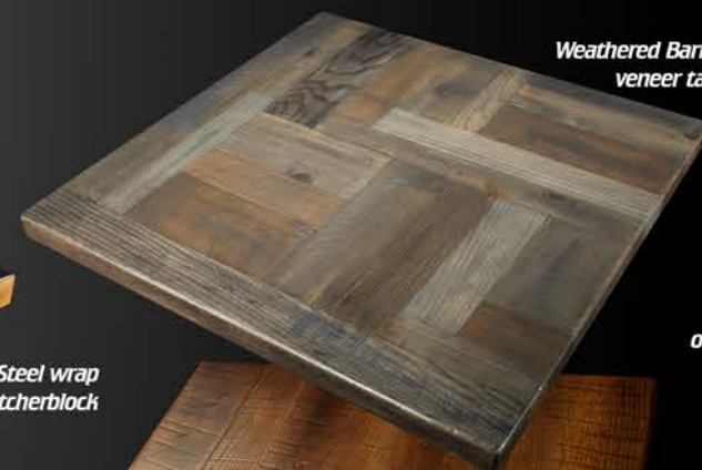
Weathered Barnboard veneer tabletop