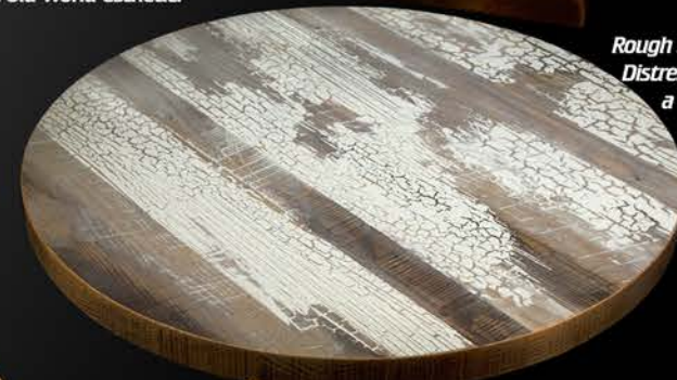
Rough Sawn Ash tabletop, Distressed and worn with a Crackle Paint effect.