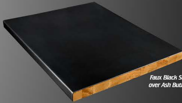
Faux Black Steel wrap over Ash Butcherblock

Chemical & Alcohol Resistant Exceptional Scratch & Wear Resistance Now Heat Ring Resistant up to 250 degrees Anti-Microbial Agent Built into the Finish