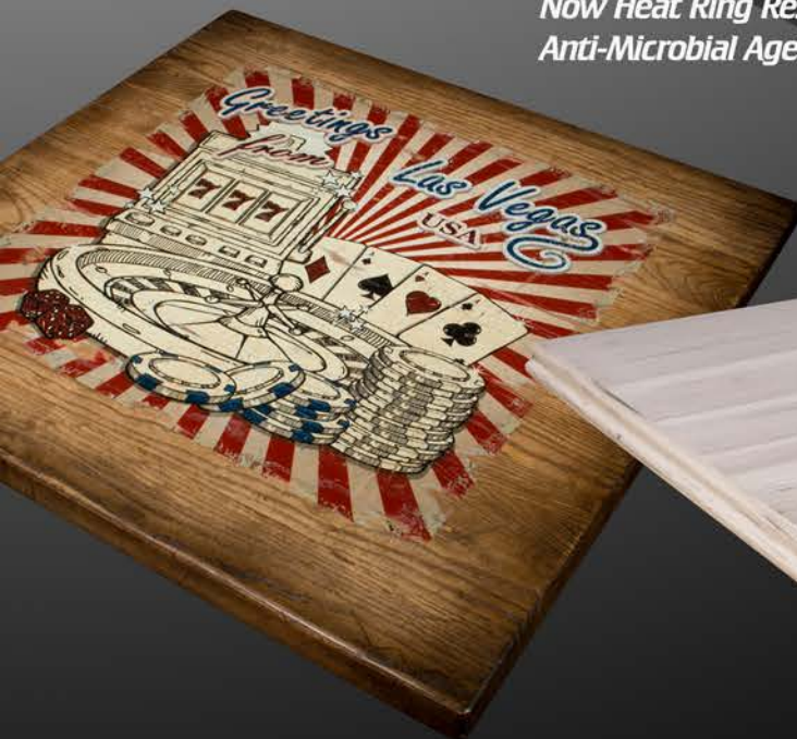
Aged Solid Ash tabletop with Nostalgic over print