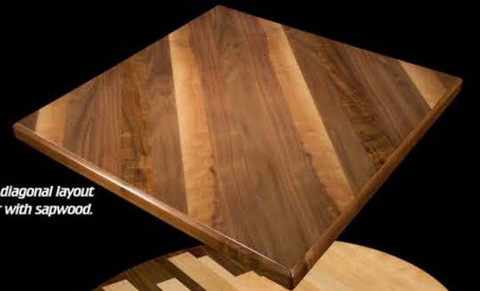
Contemporary diagonal layout of walnut veneer with sapwood.