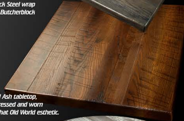
Solid Ash tabletop, Distressed and worn for that Old World esthetic.