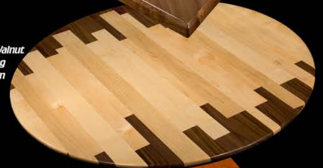
Solid Maple & Walnut in an eye catching "Skyline" pattern